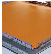
Integrated leather frame