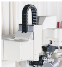
Pneumatic lift slide