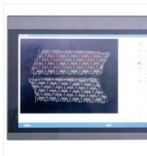
Richpeace Control System