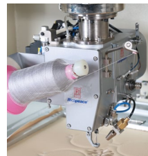
Independent-rotating sewing head and rotary hook base