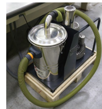
Industrial powerful vacuum cleaner